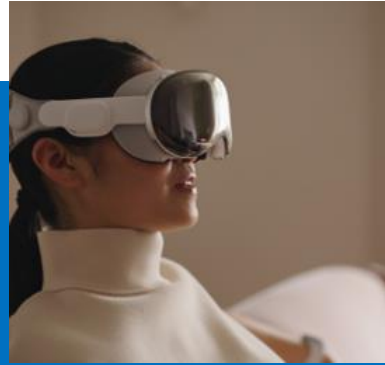
VR & Spatial Computing