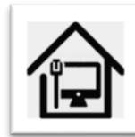
Multi-gigabit Fiber Broadband