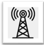
4G/5G Mobile Broadband

Key Enablers: Advancing Technologies and Expanding Connectivity