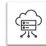
IoT, Cloud and Edge Computing